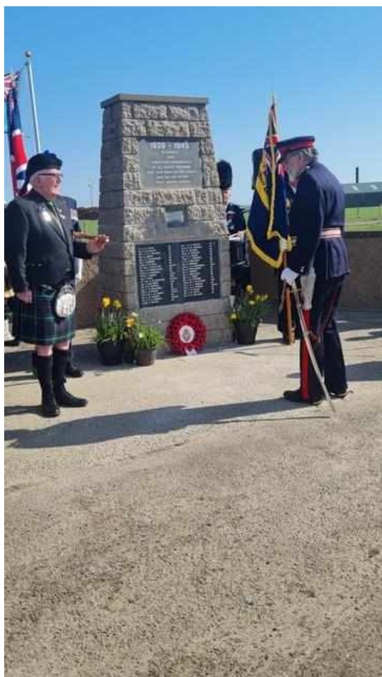
The Lord-Lieutenant of Caithness, Lord Thurso