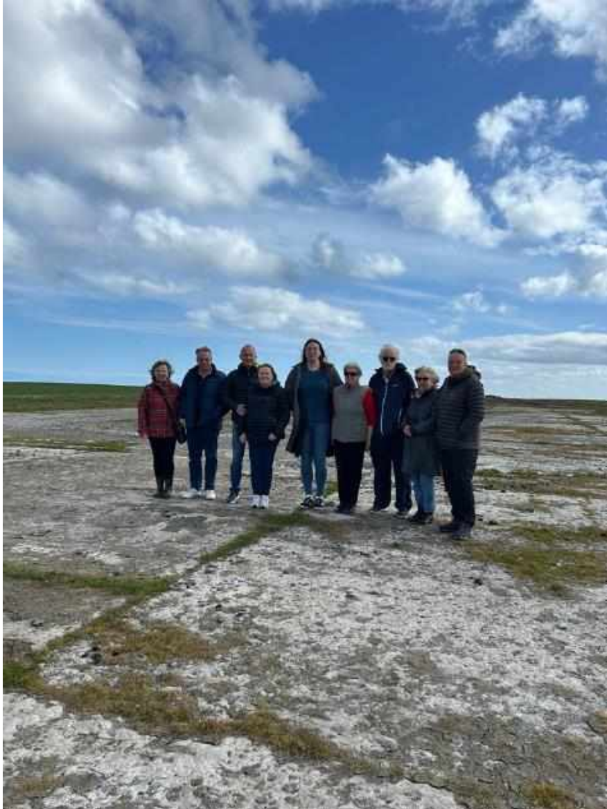
Freshman families and myself (far right) on the runway at RAF Skitten