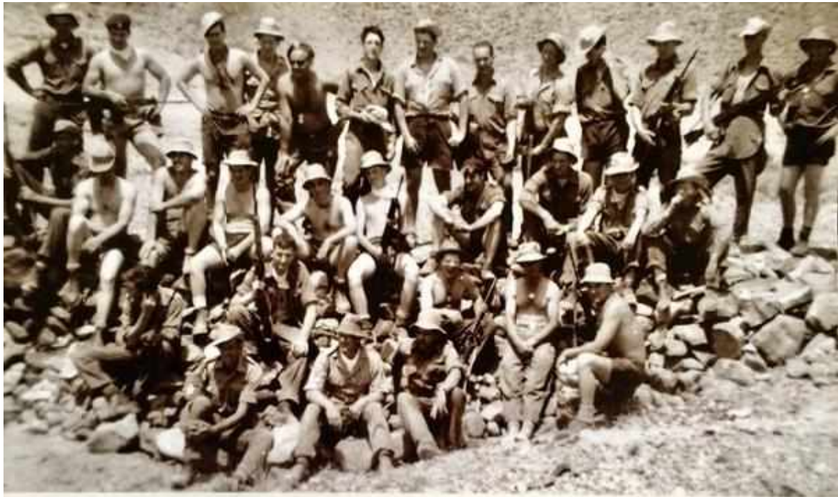
301 Squadron, 131 Para Eng Regt. Dhala Road, Aden, April 1965