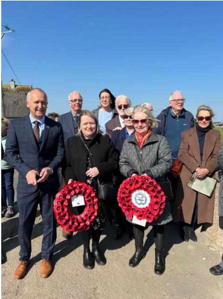
Freshman family members