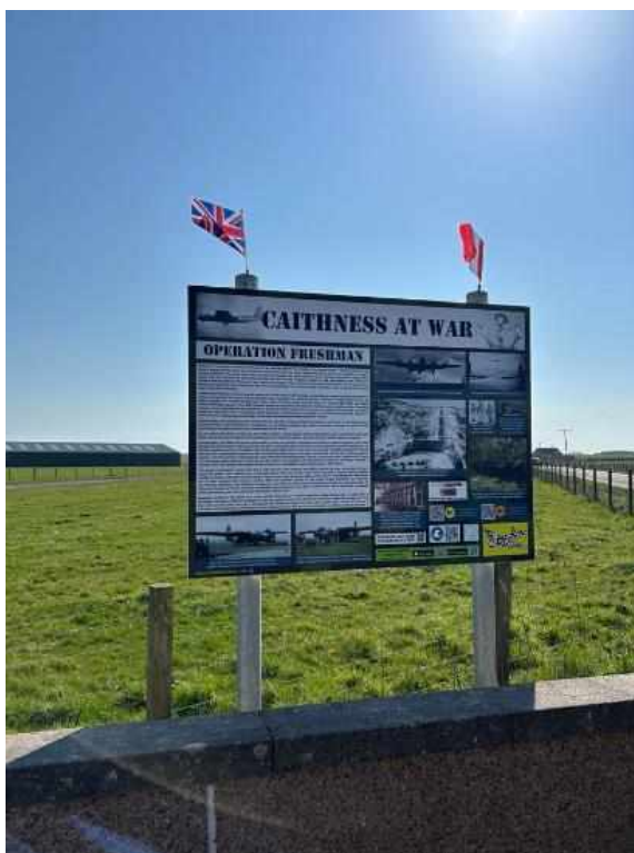
Information board at Skitten