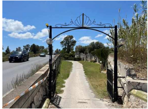
Recent photos of the bridges